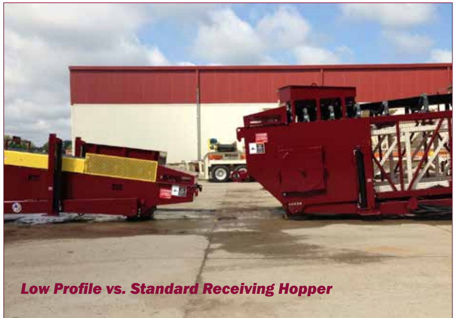
Low Profile vs. Standard Receiving Hopper