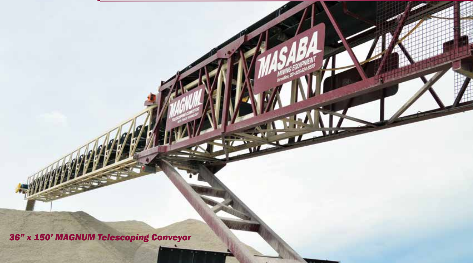
36" x 150' MAGNUM Telescoping Conveyor