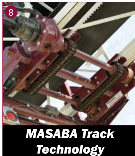
MASABA Track Technology