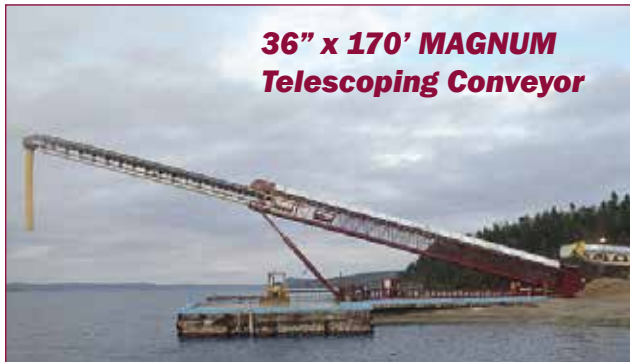
36" x 170' MAGNUM Telescoping Conveyor

5 Year Complete Structural 2 Year Complete Equipment WARRANTY